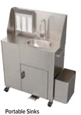
Portable Sinks PS1000 Series